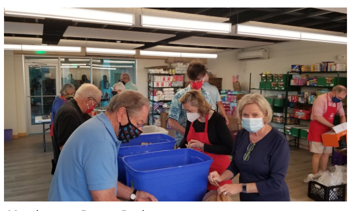
Various Naples Area Malta Members at Power Pack