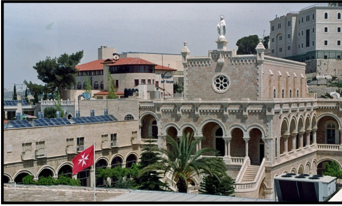
Holy Family Hospital In Bethlehem

Holy Family Hospital in Bethlehem is a joint hospitaller work of the three American Associations of the Order of Malta, providing state-of-the-art pediatric, obstetric, and gynecological care to women and children of the Holy Land. The Hospital treats all those who seek care, regardless of their religion, nationality, or ability to pay. Since 1990, Holy Family Hospital has delivered over 75,000 babies in Bethlehem.