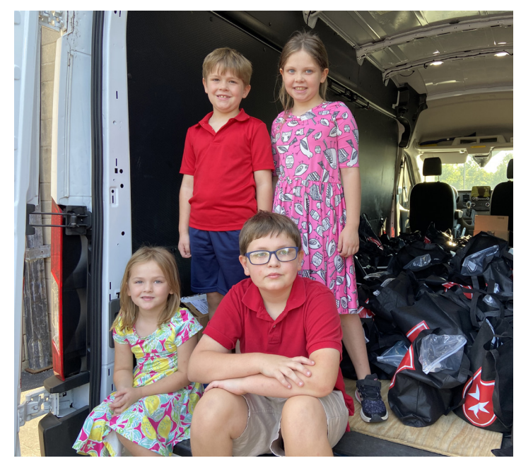
Some of Our Younger Volunteers