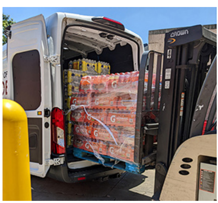
"I was thirsty, and you gave Me something to drink"

The Lord guided our members and those actively engaged in our Mobile Ministry to work together to serve this critical need for the homeless during a time the temperatures were in the high 90's for over a week.