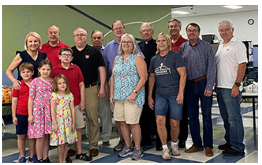
The Team for the Third Quarter Service Project

tributed by local members, filled the Missouri Area's Malta Mobile Ministry Van along with substantial cash donations for each organization. The assembly of the necessity kits was an opportunity not just to help others but also enjoy the company of fellow Malta members and their families.