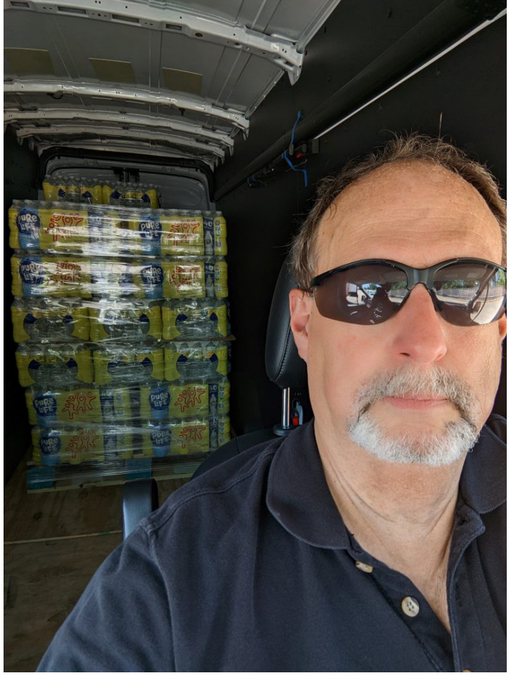
A Cool Malta Driver on a Hot Day