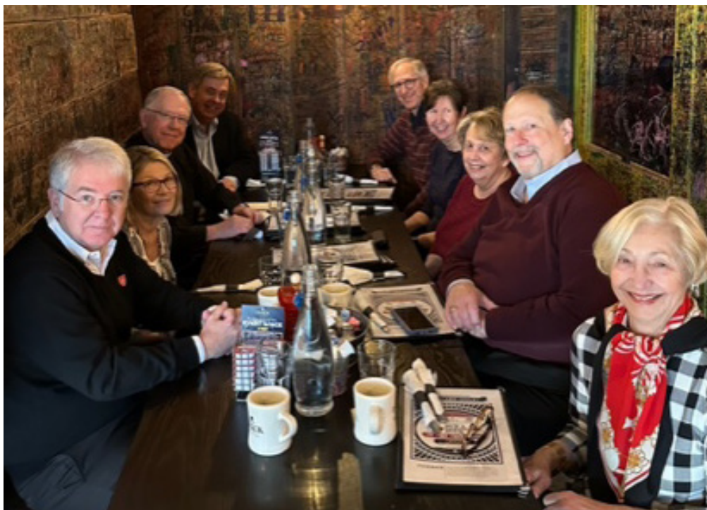
Members Sharing Breakfast after Mass