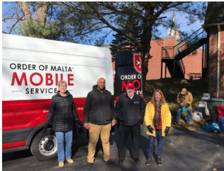
Our Lady of Guadalupe Food Bank and Souting for Food

recently released convict feel that they have a home in the community. Besides aiding those in need, Malta Mobile Ministry provides the means for those that feel called to help their neighbor. Often a simple lack of transportation makes that impossible, and that is where Malta Mobile Ministry finds its role. The photos here show some of the people and causes we have served.