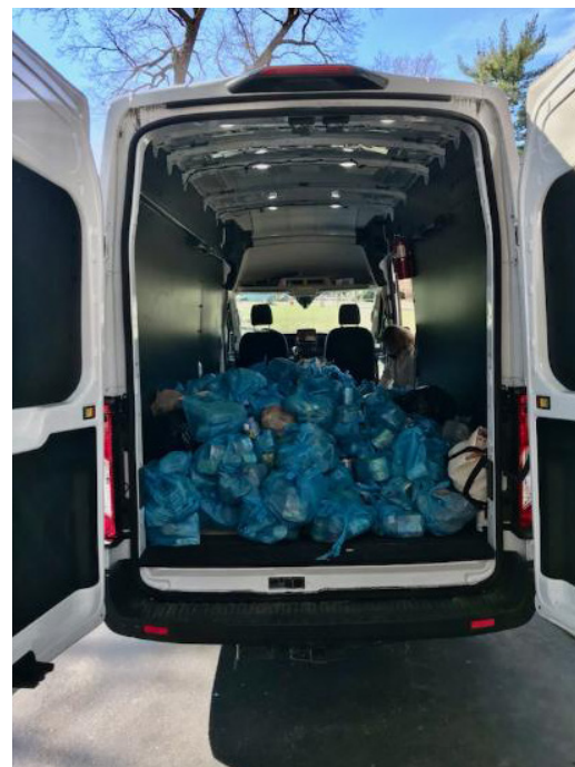
All Saints Contributions

The leadership at the three organizations were enthusiastic in their thanks, and we can be sure that our gifts brightened the lives of the people they serve.