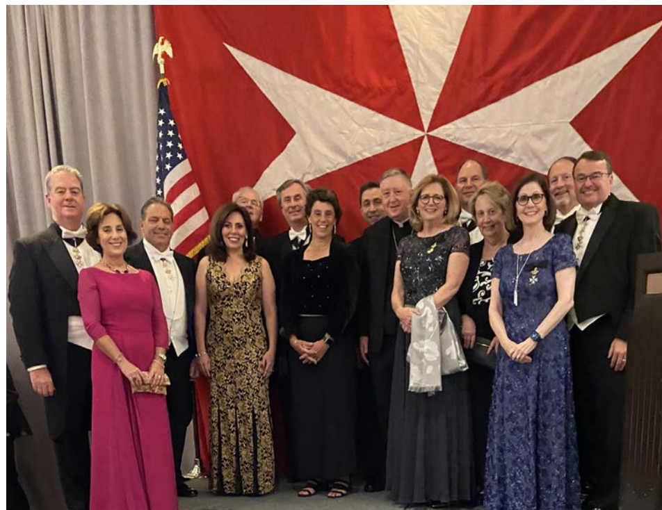
With Archbishop Rozanski