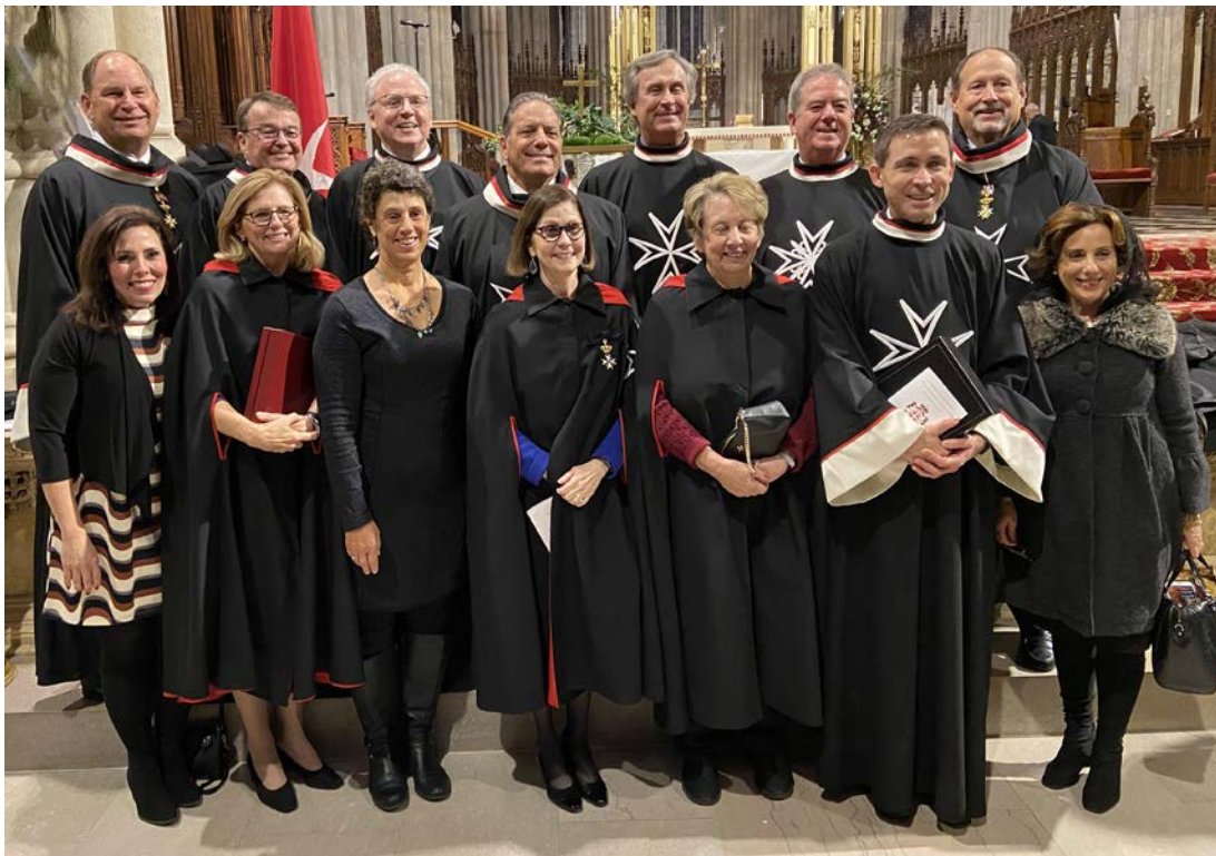
Those from Our Region