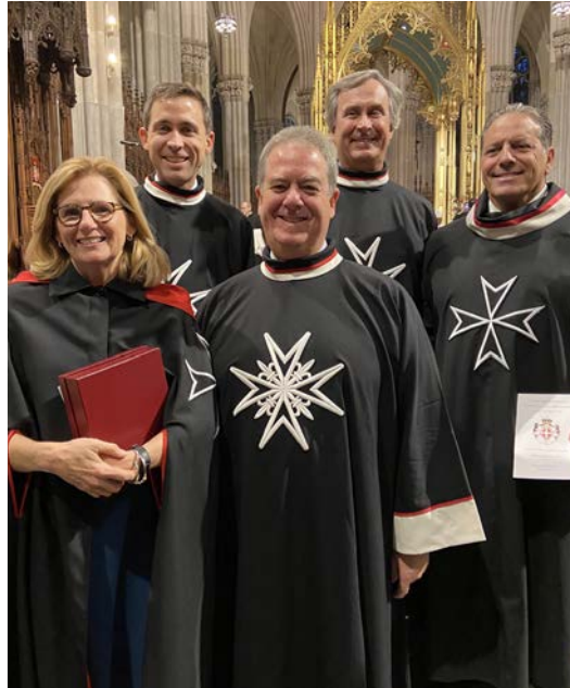
The Newly Invested