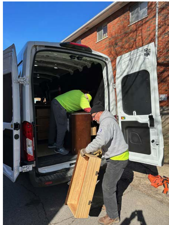
With the "Holy Haulers" of St. Vincent de Paul for Criminal Justice Ministry