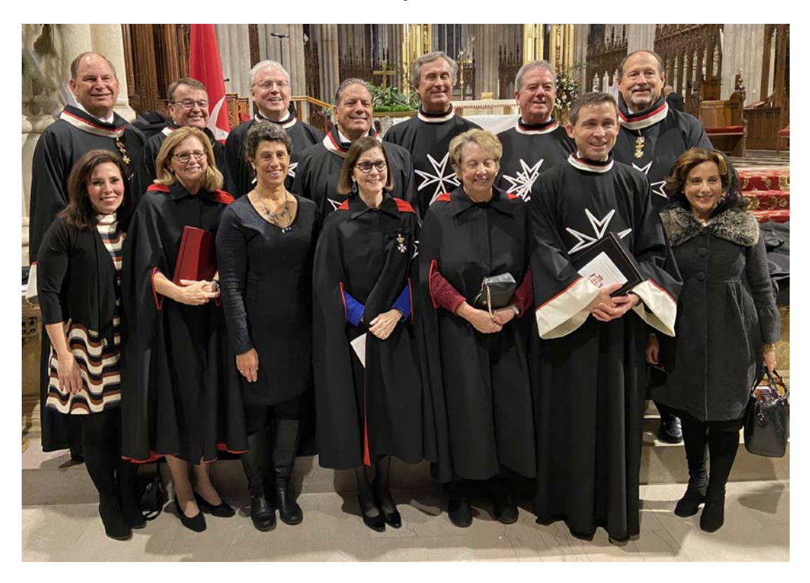
Those from Our Region