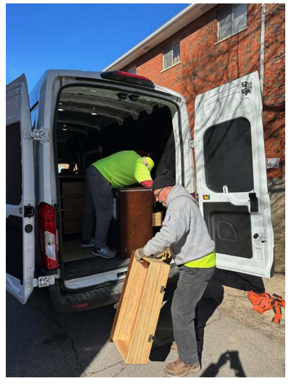
With the "Holy Haulers" of St. Vincent de Paul for Criminal Justice Ministry