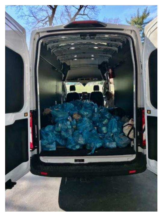
All Saints Contributions

The leadership at the three organizations were enthusiastic in their thanks, and we can be sure that our gifts brightened the lives of the people they serve.