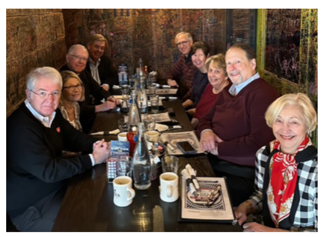
Members Sharing Breakfast after Mass