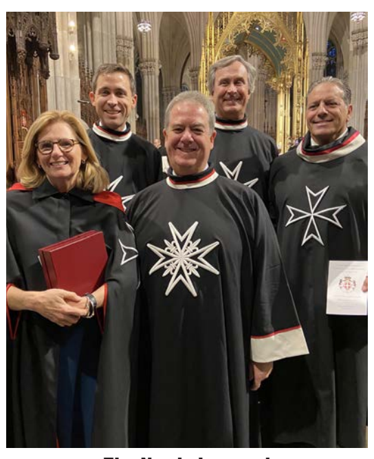
The Newly Invested