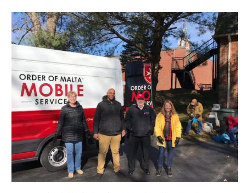
Our Lady of Guadalupe Food Bank and Souting for Food

cently released convict feel that they have a home in the community. Besides aiding those in need, Malta Mobile Ministry provides the means for those that feel called to help their neighbor. Often a simple lack of transportation makes that impossible, and that is where Malta Mobile Ministry finds its role. The photos here show some of the people and causes we have served.