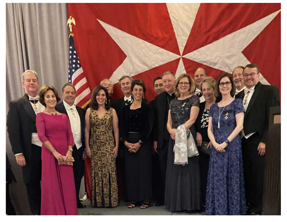
With Archbishop Rozanski