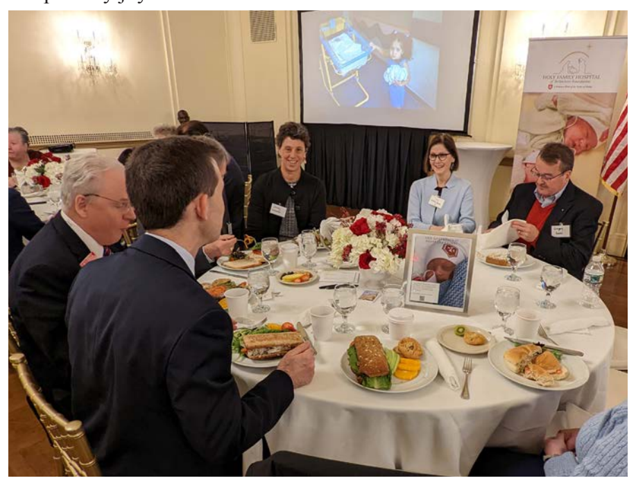
Lunch for Holy Family Hospital amid Reminders of its Work

Earlier in the day, many members, malades from previous pilgrimages to Lourdes, and their familes, gathered at St. Patrick Cathedral for a Mass for the Intention of Living and Deceased Malades. Mass was follow by a luncheon in support of the Holy Family Hospital in Jerusalem, where members both learn about the needs of the hospital and enjoyed joyful reunions with their fellow pilgrims.