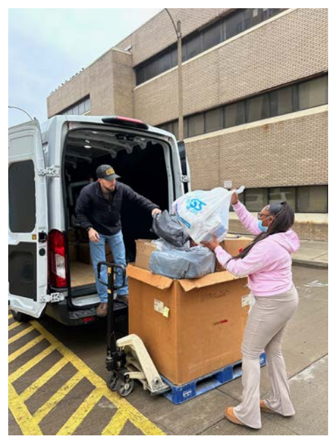
Warmth Collected and Delivered

The homeless have a great but often forgotten need. The need clean, sturdy socks. Working with several parishes, the St. Patrick Center has worked to supply that need, and for a second year Malta Mobile Ministries have help, by collecting the socks form St. Richard Catholic Church and delivering them to the St. Patrick Center downtown. The people of St. Richard and