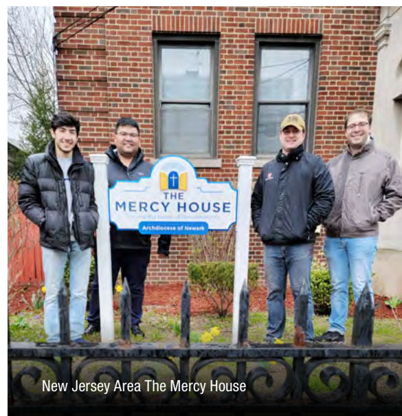
New Jersey Area The Mercy House