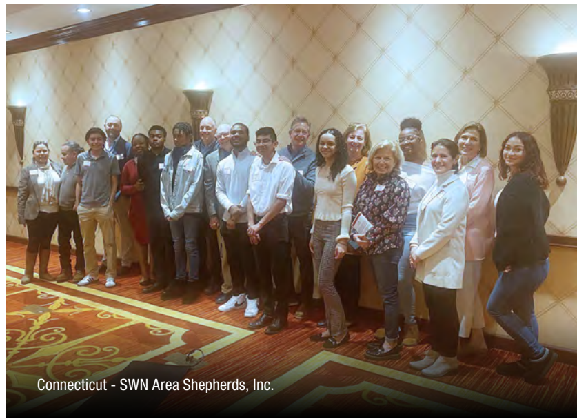
Connecticut - SWN Area Shepherds, Inc.

See pages 24–26 for a complete listing of the 2023 Area Grants Program.