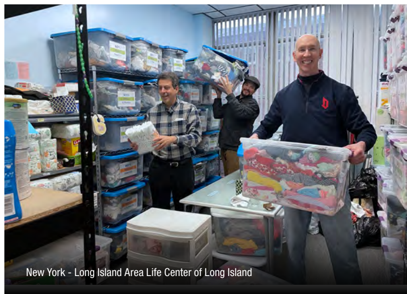
New York - Long Island Area Life Center of Long Island