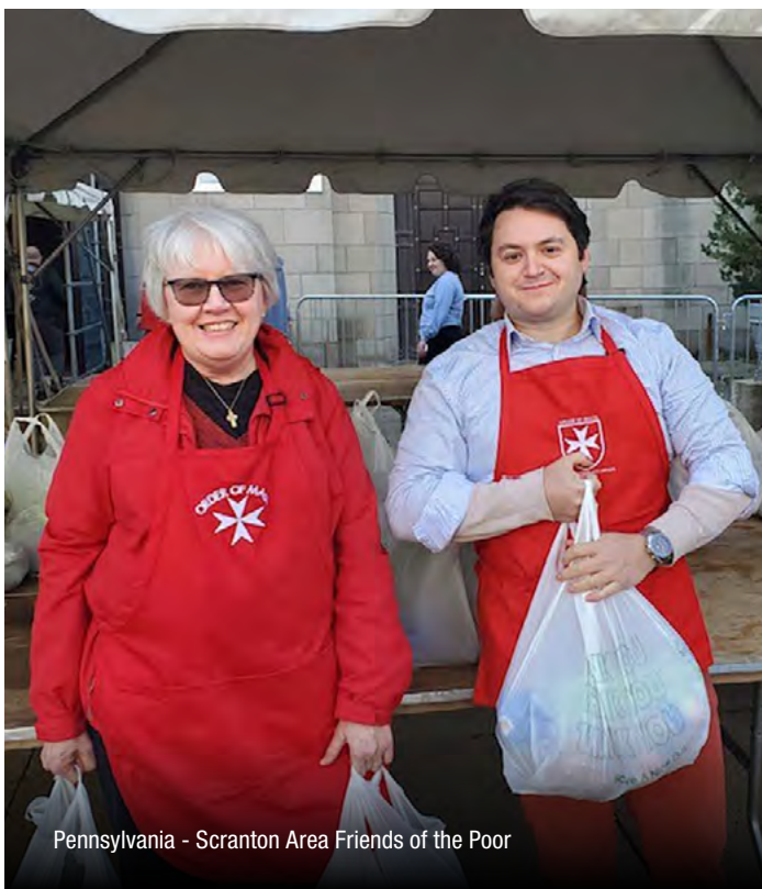
Pennsylvania - Scranton Area Friends of the Poor