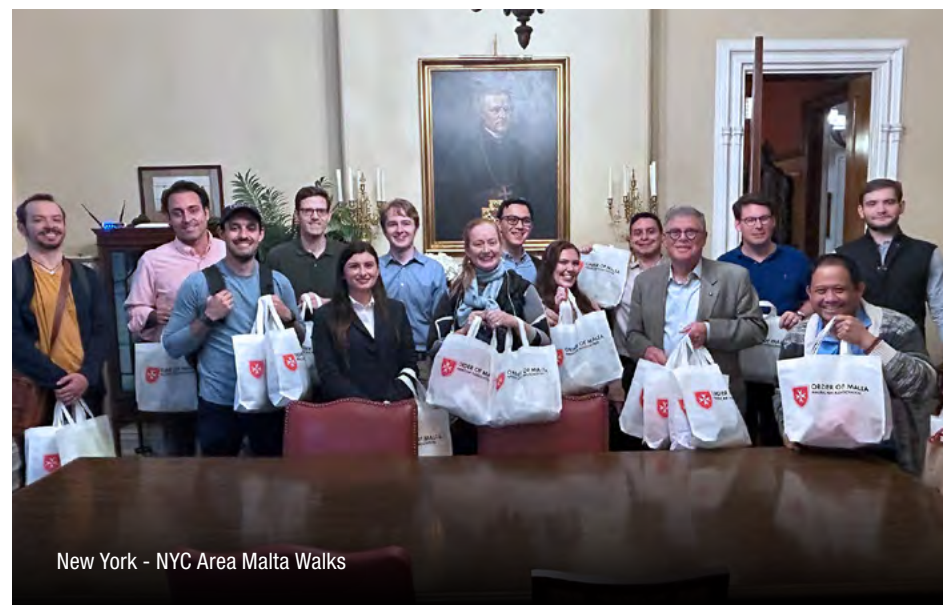
New York - NYC Area Malta Walks