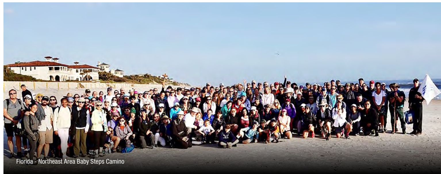
Florida - Northeast Area Baby Steps Camino