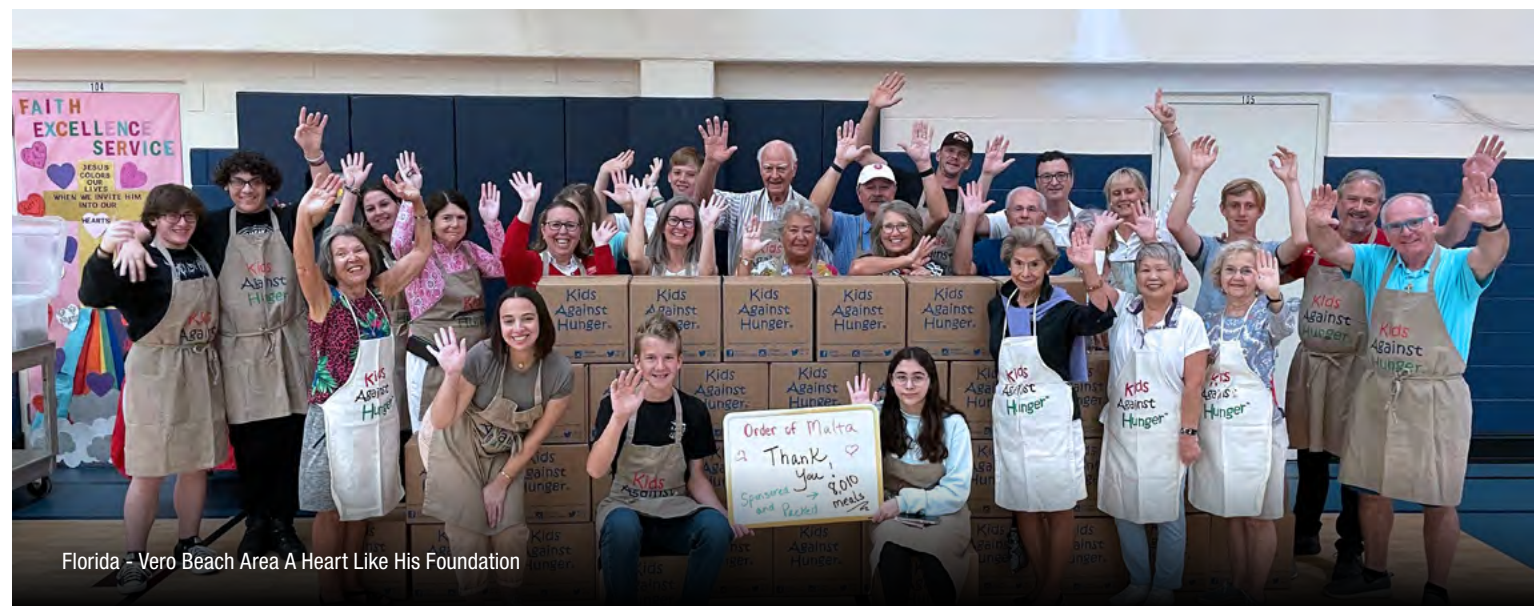
Florida - Vero Beach Area A Heart Like His Foundation