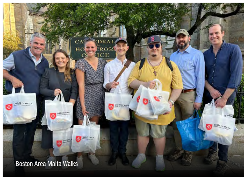
Boston Area Malta Walks