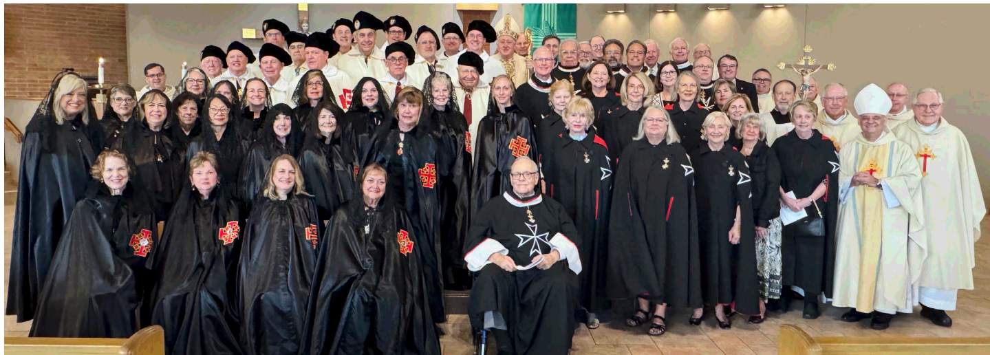
After the St. John's Day Mass with the EOHSJ