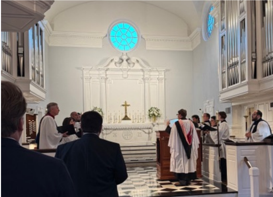
2025 St. Louis Evensong for the Feast of the Blessed Gerard St. Peter's Episcopal Church, Ladue