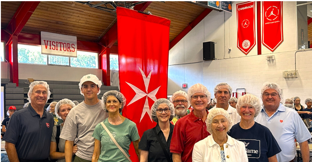
The Malta Missouri Team at the Haiti Health Promise of Holy Name Packathon