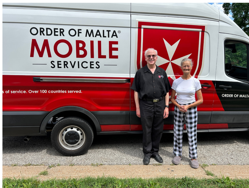
Malta Mobile Dirver with Cardinal Ritter Senior Services Client

Eight drivers took the wheel, sometimes making more than one run in a single day. We would be happy to add more active drivers to the roster!