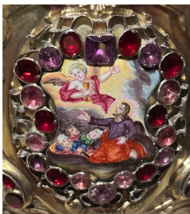
Detail from a Chalice in the Exhibition of Treasures from the Church of the Holy Sepulchre at the Frick Collection