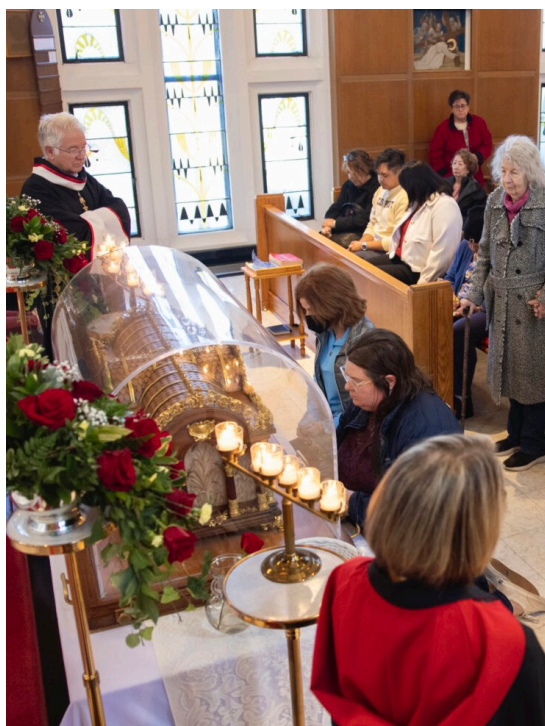
A Knight and Dame Stand as Guard of Honor While Relics of St. Thérèse are Reverenced

Missouri Area members of the Order of Malta recently served as Honor Guards for the relics of St. Thérèse of Lisieux. At the invitation of the Provincial Superior of the Carmelite Sisters of the Divine Heart of Jesus, 16 knights and dames stood watch on the night of November 9 and throughout December 10 beside a reliquary containing some of the saint's bones while it lay in response at St. Agnes Home in St. Louis. Malta members are regular visitors to St. Agnes home, where they have often assisted with bingo games for the residents and joined them and the sisters for mass in the chapel where they now stood vigil.