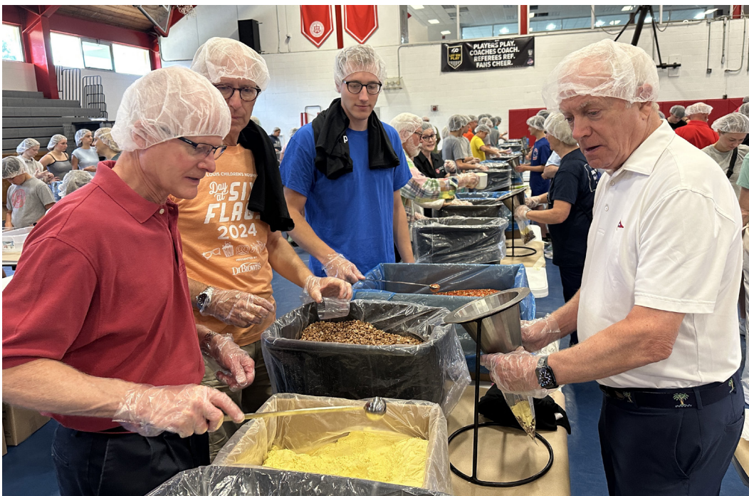
Malta Members at work at the Packathon