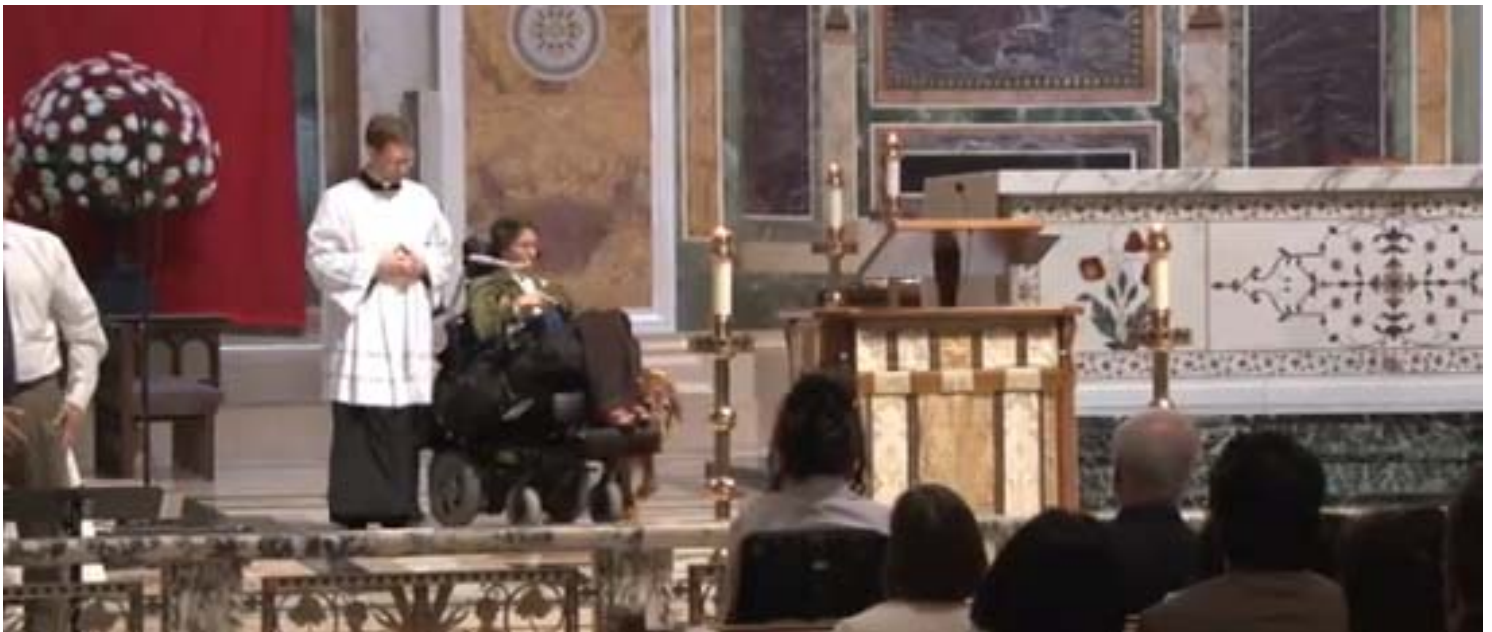
2nd Annual White Mass, Archdiocese of Washington