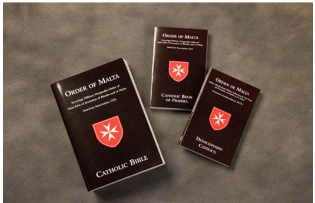
Some of the materials distributed by the Prison Ministry