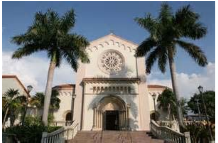
St. Patrick's Catholic Church, Miami Beach, FL