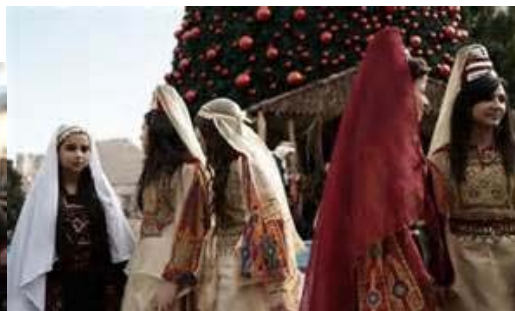
Christmas in Lebanon