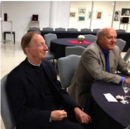
Annual Meeting and Dinner: June 26, 2013 Barry University