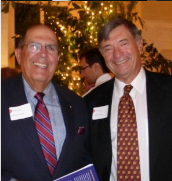
Everglades Club Reception