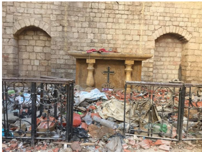
An altar at the Maronite Church of Our Lady stands amid rubble and debris from the bombardment in the city of Hamideyi, Aleppo.

The big concern is how truly to help Christian in the Middle East. If it continues like this, in several years there will be no Christians in the Middle East. This is a big concern for me, especially since they are among the first communities of Christians. You see the image of the Gospel in them. They live the same faith as the first Christians. They preserve the same tradition. The churches need to be reconstructed to preserve this unique tradition in the Middle East. They need a safe place to practice their faith. Right now, the local Church needs support to build the churches and tend to the material needs of the Christians. The pastors and religious communities there have remained with their people and are to helping take care of them. It is like the image in the Gospel of the Good Shepherd with his flock. And I see it with all the local Church communities: Maronite, Melkite, Armenian and Orthodox. Aleppo is really a center of ecumenism.