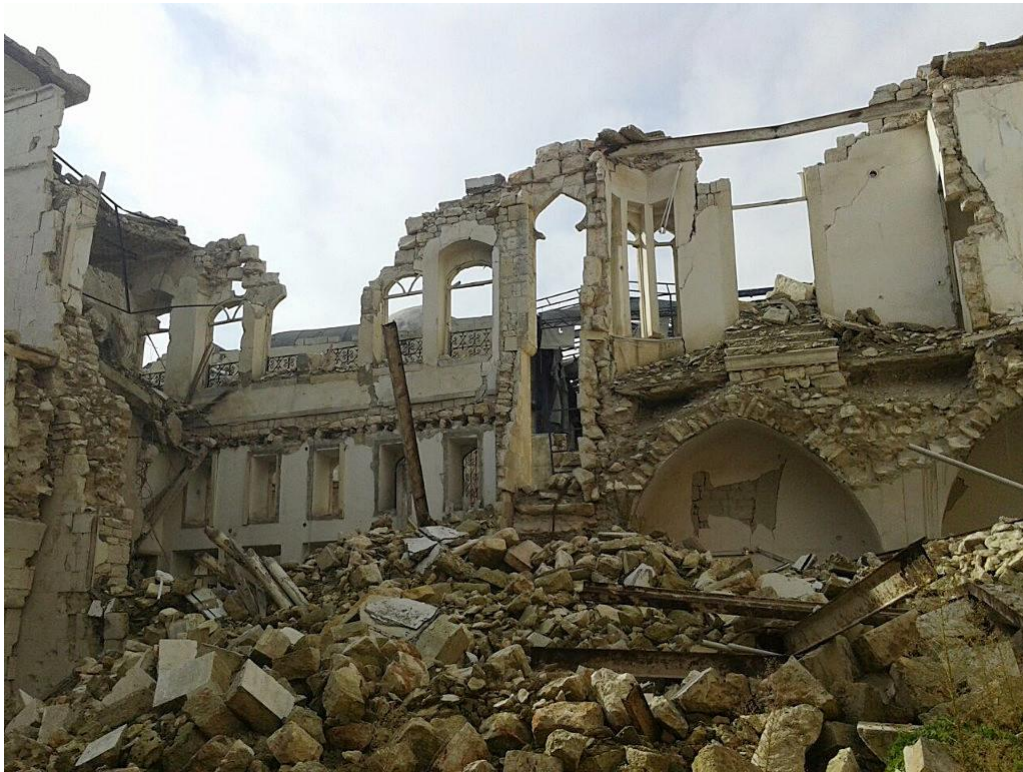
The Mar Assia Al-Hakim Syriac Catholic Church, built in Aleppo in 1500 AD was destroyed in the conflict on September 16, 2012.