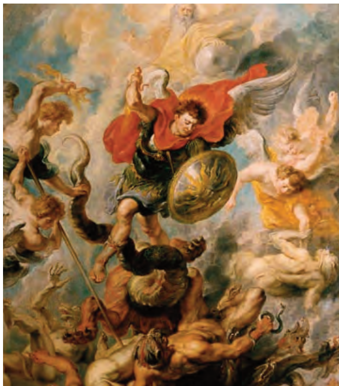
Painting by Peter Paul Rubens, c.1620