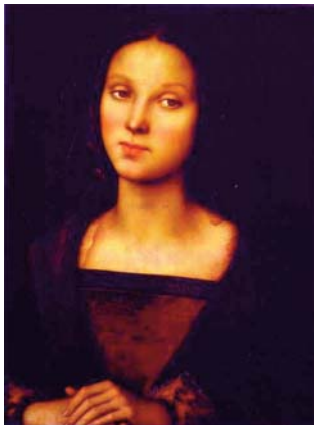
St. Mary Magdalene

And on the third day, on the first Easter Sunday, Mary Magdalene became the first to see Jesus Christ risen from the dead. She had come to His tomb early in the morning and found it empty. Jesus appeared, but she didn’t recognize Him. At first, she thought He was the