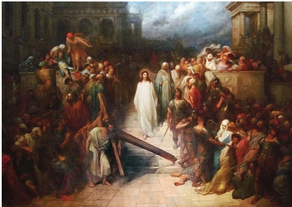
Christ Leaving the Praetorium Painting by Gustave Doré (French, c. 1873)