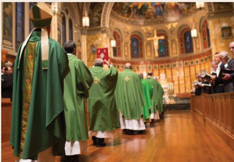
Processing into St. John's Chapel