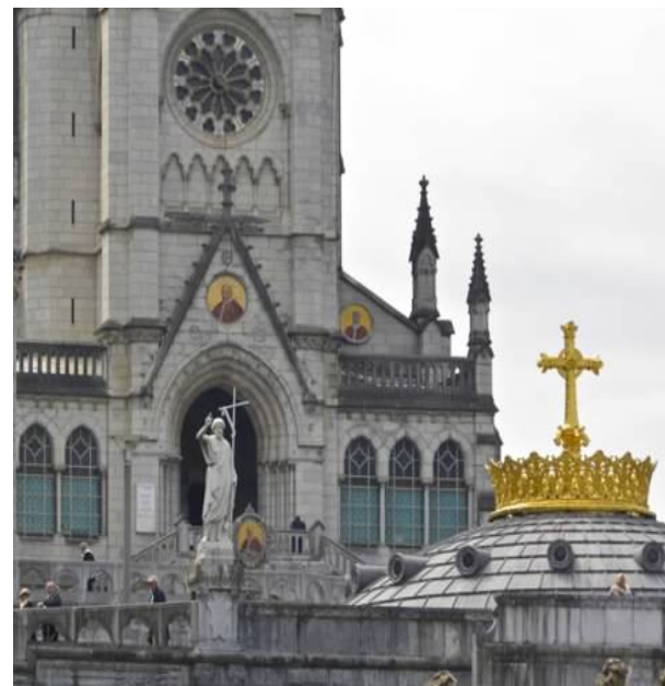
The Upper Basilica at Lourdes