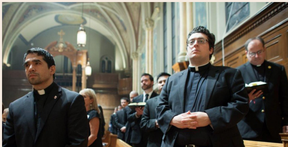
St. John’s Seminarians