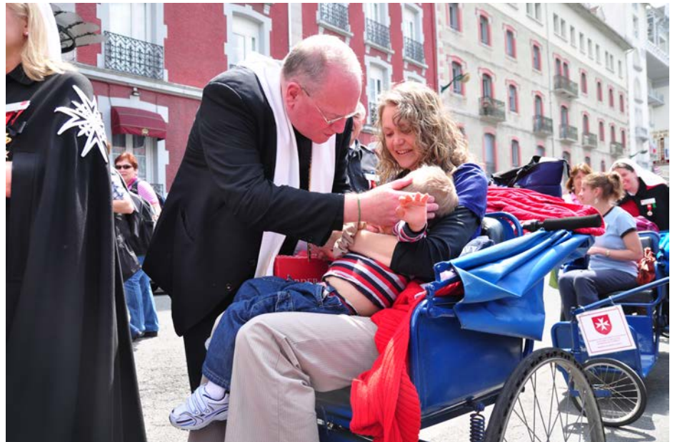
Cardinal-designate Dolan blessing a Malade. Lourdes Pilgrimage 2011

The conferral of the Biretta (Red Hat) will be held at St Peter's Basilica on Saturday, February 16th for Cardinal-designate Dolan and the new class of Cardinals.