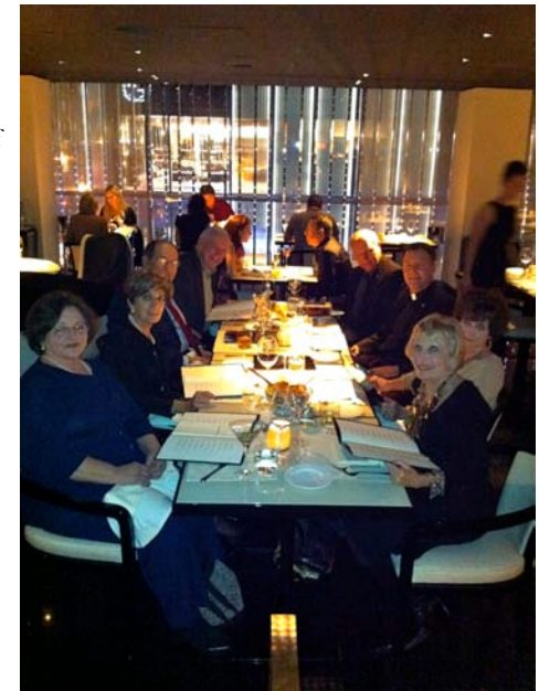
Dinner at Armani South Florida Area Dinner