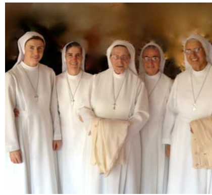
Our beloved Sisters of The Marian Center:

fantastic Saint Patrick's Day party with music, dancing, a five course meal and libations to beat the band. I encourage all members to register for the great Conference. Please see our live registration website at: https://www.orderofmaltasouthflorida.org for registration on-line via credit card and for purchasing space in the perfect bound Commemorative Journal that will contain the proceeding of the Conference along with great ads.