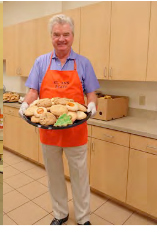
Volunteering at St. Ann Place West Palm Beach