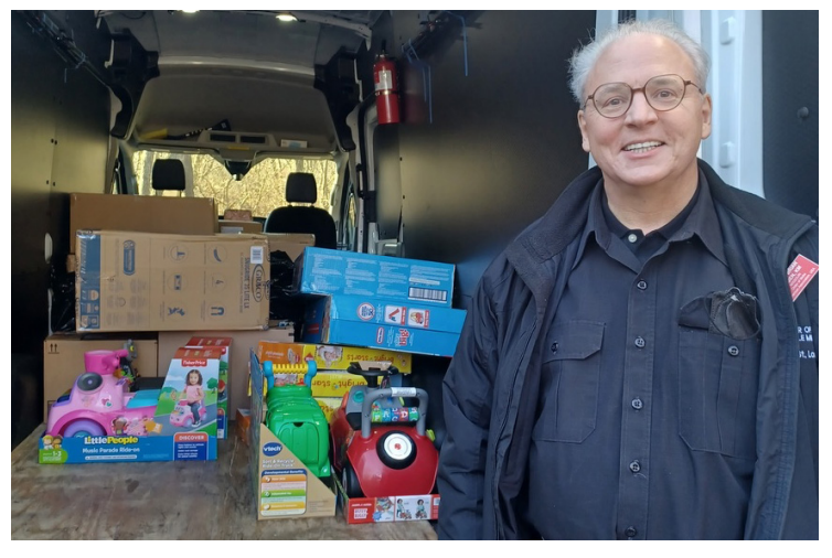
The Malta Mobile Ministry Van with a Cargo of Toys and Goodies