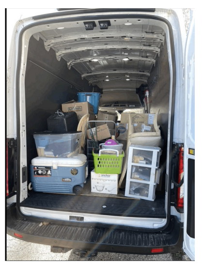
What a Family Would Lose Without Our Help

Sometimes, a family must vacate one apartment before they have found a new home and face seeing all their belonging left on the curb, even if a new home will be available in just a few days. Mobile Ministries has helped such families, getting the furniture, the clothes, and the cardboard boxes labeled "math books and board games" into storage before time runs out.