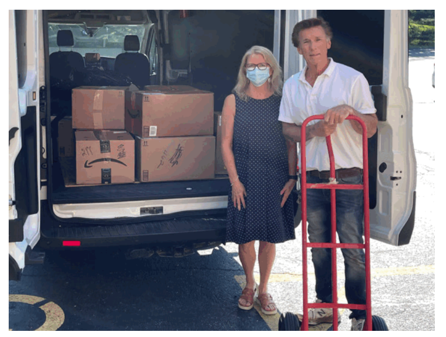
The Staff of St. Richard's Parish and 6,302 Socks

Sometimes, a family must vacate one apartment before they have found a new home and face seeing all their belonging left on the curb, even if a new home will be available in just a few days. Mobile Ministries has helped such families, getting the furniture, the clothes, and the cardboard boxes labeled "math books and board games" into storage before time runs out.