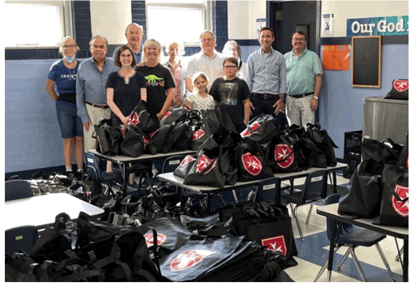
Volunteers with Basic Comfort Packs

Our September Day of Service brought together a number of members of the Order of Malta family at Immacolata Parish to sort and pack toiletries and snacks for Father Bob's ministry to those in need in the North City area. We packed about 200 bags and loaded up the Mobile Ministry van for the delivery of the personal care bags directly to Father Bob's fulfillment location. A very successful service project that allowed many members across our area to participate.