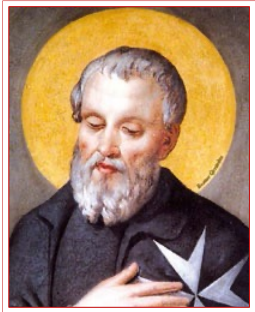
Blessed Gerard Founder of the Order

I ask this in Your Son's name, Jesus Christ, my Lord and Savior. Amen.